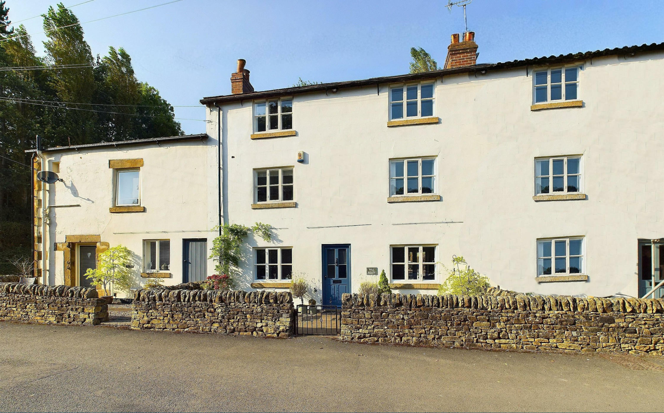
Mill House Low Matlock Lane, Loxley, Sheffield, S6 6RN